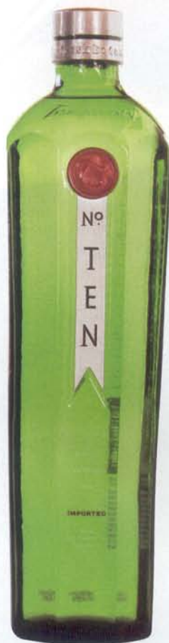
♣ TANQUERAY NO. TEN (England, 94.6 proof)

The back of the squat black jug says, "It Is Not for Everyone." Botanicals unique to this brand include Holland cucumbers as well as Bulgarian rose petals. Verdict: Reduced taste of juniper compared with others and more assertively floral. The cucumber adds complexity and brightness; often served as a martini garnished with cucumber to add to the effect.