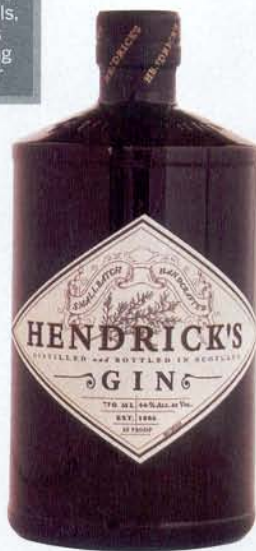
♣ HENDRICK'S GIN (Scotland, 88 proof)

Gin: Clear grain spirit flavored with a variety of botanicals, always including juniper