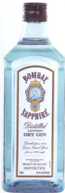
♣ BOMBAY SAPPHIRE (England, 94 proof)

In 2004, Derek and Sonja Kassebaum founded North Shore Distillery, the first licensed and bonded craft distillery in Illinois. Made in a custom-built German copper still in Lake Bluff, their gin is infused with ten botanicals, including cardamom, lavender, and cinnamon. Verdict: Wonderful complexity with pronounced floral aromas and flavors; easy to sip neat even at room temperature. I'm not just jingoistic; it really is the best of the bunch.